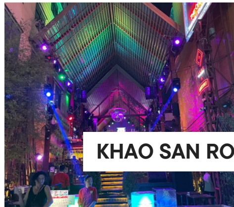
KHAO SAN ROAD